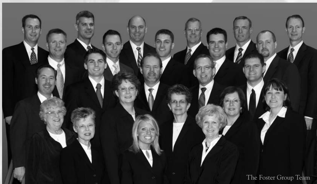
The Foster Group Team

Delivering lifeWealth planning services including fee-only portfolio management, retirement planning, estate & charitable giving strategies, risk management & education funding.